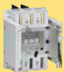
4225 88 + 4225 93